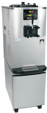
Optional cart with front opening door