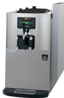
Optional top air discharge chute

750 N. Blackhawk Blvd. Rockton, Illinois 61072 800-255-0626 Phone 815-624-8333 Fax 815-624-8000 www.taylor-company.com info@taylor-company.com