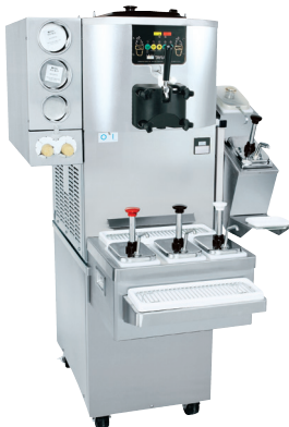
Optional cart with rear door for front mount syrup rail